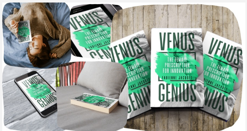
Illustration by Xue Bai